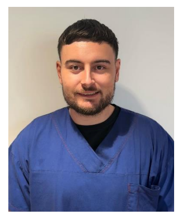
Uncontrolled when printed